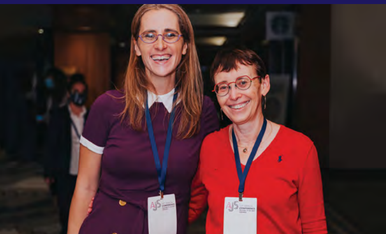
EXHIBIT AT THE CONFERENCE—